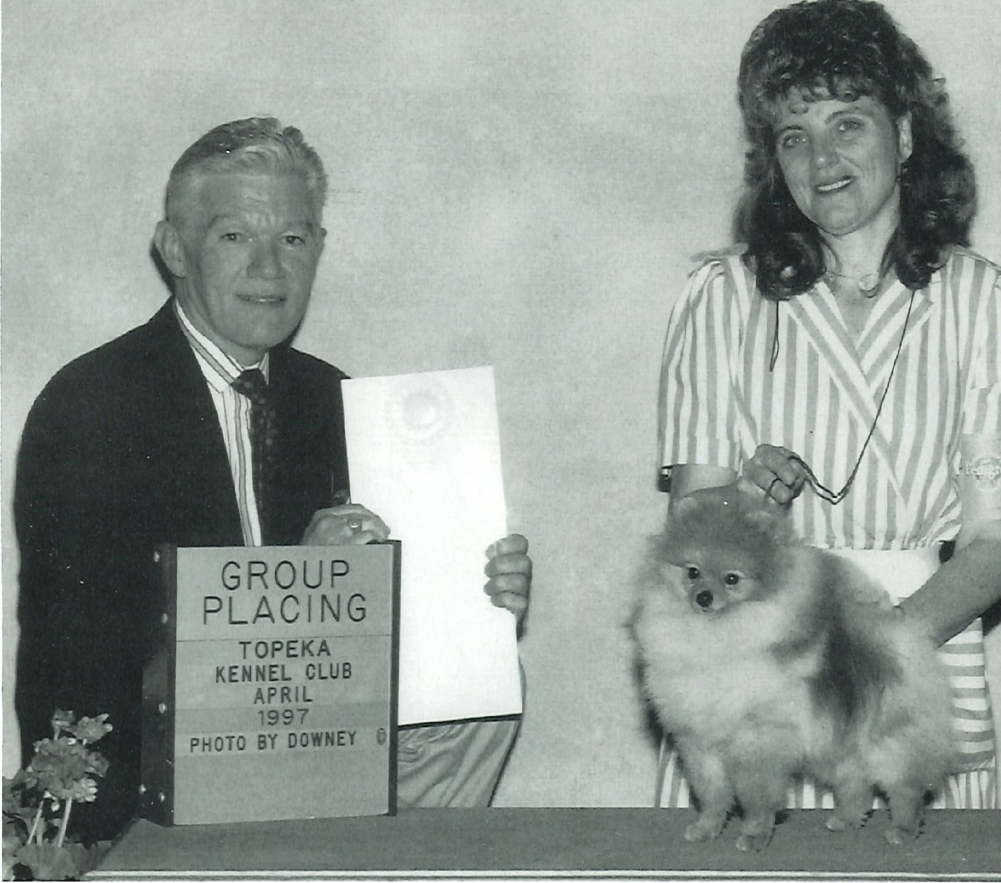
(Ch. Ozark's Mighty Mite x Ch. Westwood's Amazing Grace)