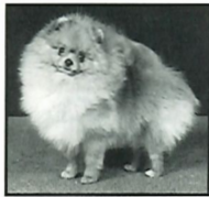
Australian Ch. Dochlaggie Domino