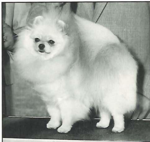
Ch. SunRay Gold Strike - "Striker"

• Moving back to our home soon. • Watch for our new phone number. •