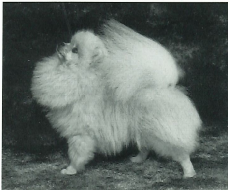
Toybox Small Print, not a champion himself but the sire of many famous champions including Ch. Toybox Platignum Phantom.