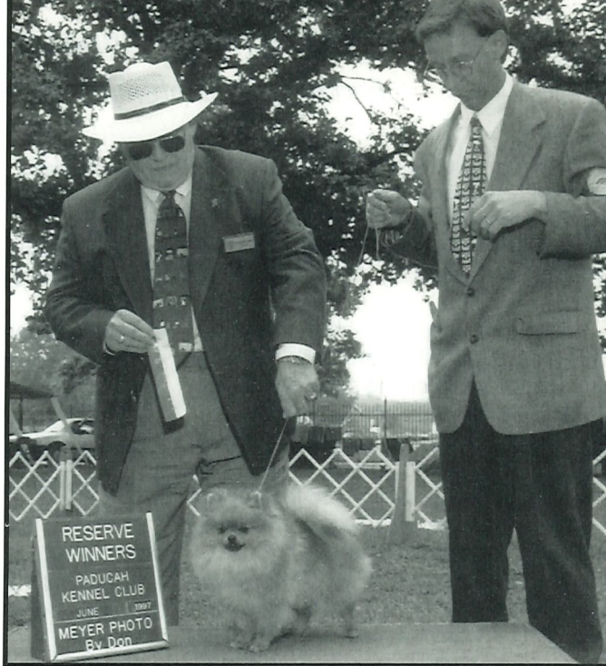
Ragdoll's Tango of Sourwood x Ragdoll's Candle In The Wind