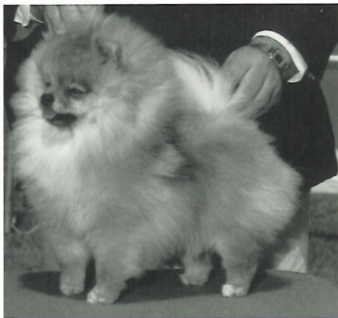
Ch. GoldCrest Pacific Dreamer