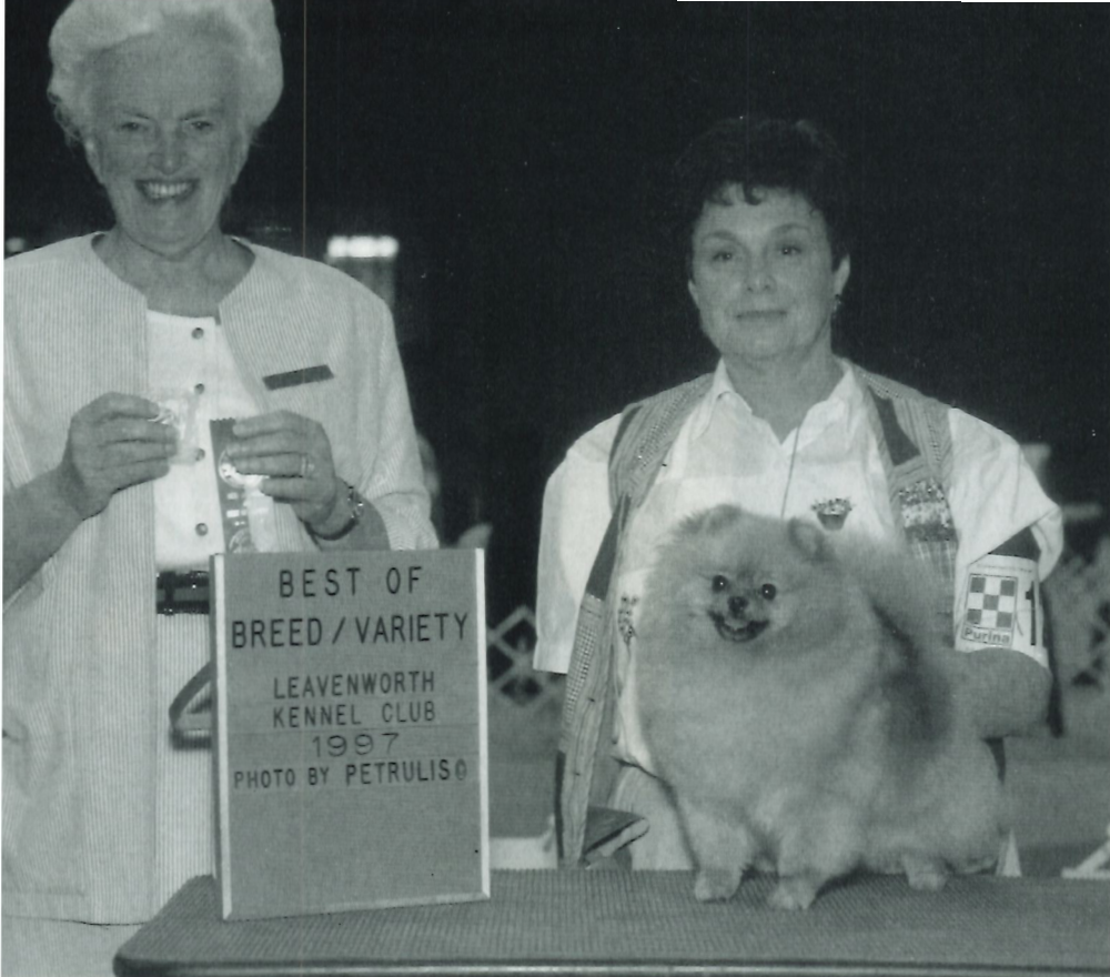
(BISA, BISS Ch. Valcopy-Wakhan Valentino x Ch. Valcopy-Wakhan Scarlett Fever)