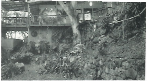
The Dragonfly Ranch: Tropical Fantasy Lodging, Kona Coast, Hawaii.

You may wonder, “Why a dog food recipe?” One day, a guest returning from a long swim with the wild dolphins near my &B, smelled my cooking and asked, “What’s this?”