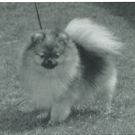
Ch. Toybox Halfway To Heaven by Int Ch. Stolanne's Highway To Heaven. Her litter sister, Ch. Toybox One Step To Heaven finished a few days earlier.