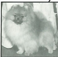
Ch. Tru-Kep's Starman