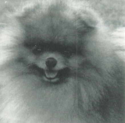
n. Can. Irish Ch. Stolanne's Highway To Heaven at Toybox, top Pom in Ireland for 1995 and a multiple Best in Show winner.

of Sueacres Poms. In one of those years, I had the Top Pom in Britain, Southern Ireland, Denmark and Finland with dogs I had sold. I have been Top British Breeder several times and had Top Pom, Top Stud Dog and Top Puppy several times also and have bred countless champions worldwide, including Ireland, Iceland, Finland, Germany, Australia, New Zealand, Portugal, Denmark, Germany, and Sweden to the great satisfaction of their owners. I have always tried to send my best.