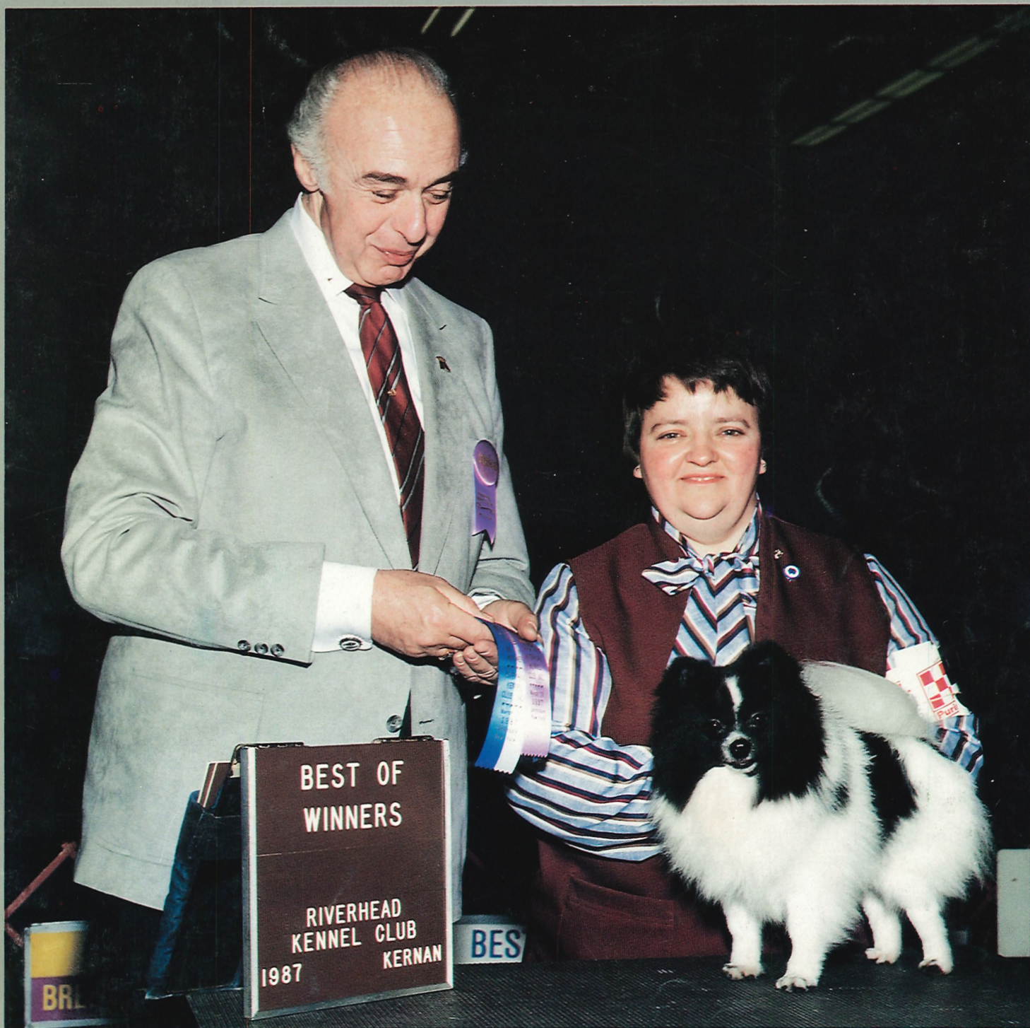
POMBREDEN'S HEAVENLY TOY BOY