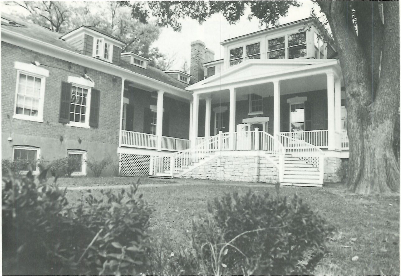
Rear entrance to the Dog Museum at Jarville House in Queeny Park, St. Louis County, Missouri

The Dog Museum of America opened the doors to its new home in St. Louis on Sunday, November 1, 1987. The museum, housed in the historic Jarville House in Queeny Park, West St. Louis County, will rotate exhibit selections from its permanent collections.