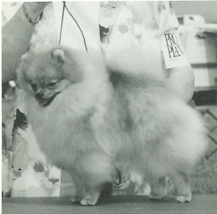
CH. EMCEE'S SOLID GOLD PRINCE