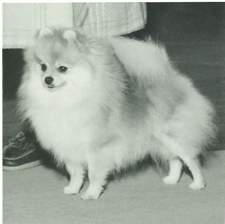
Homebred Champion #43

Breeders of 44 Pomeranian Champions, 27 Norwich Terrier Champions, 1 Irish Setter Champion