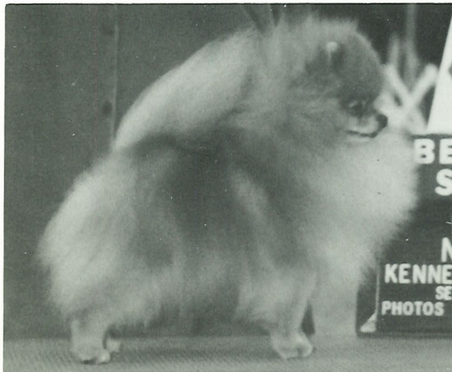
Ch. Coy's Top Of The Mark