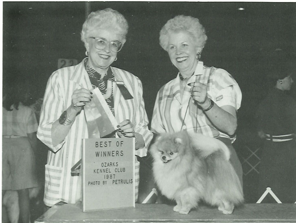
Ch. Dixieland Rock of Millamor x De Arta's Dancing Delite Finished his championship in October 1987.

★ Lovely show prospect male for sale: 1 year old, 3¾ lbs., LLL and Millamor breeding ★ Breeder/Owner/Handled by