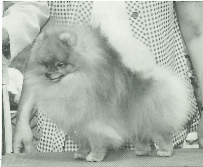
Ch. Cedarwood's Image of Diamond