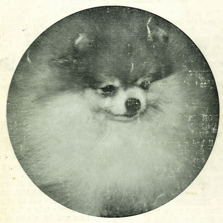
CHAMPION CORN'S DUKE DRAGONFLY TOP WINNING POMERANIAN IN THE NATION FOR THE SECOND CONSECUTIVE YEAR!