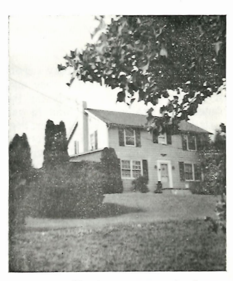
"Givenswood" - home of Roanoke Poms

Both Roy and Frank were interested in the basement type kennel quarters, as it provided the opportunity to constantly be with the dogs. This kennel is situated in a waik-out type of basement, well lighted and well ventilated, and has facilities for from 25 to 30 poms. They have built nine 4x10 ft. runs along one side of the wall, and three smaller, rectangular runs across from these, with an aisle running down the middle leading to the grooming part of the kennel. The poms are exercised in a large yard