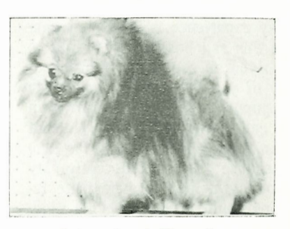
International Champion Creider's Bit 'O Distinction