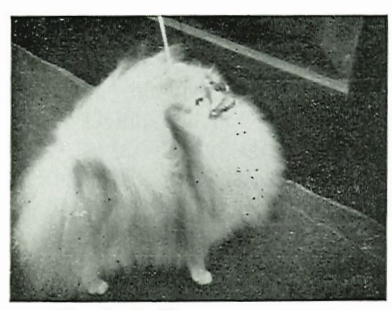
Ch. G. E. Timstopper Again