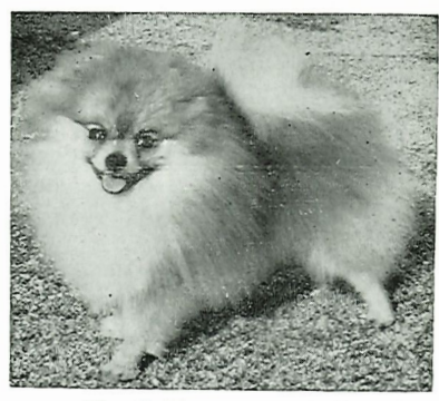
Ch. Golden Glow Sir Reginald Shaded Bright Orange Siring Stylish Puppies Fee on Request

Rt. 1 - Box 555, Newcastle, Cal. 95658 Phone: (916) 663-3612