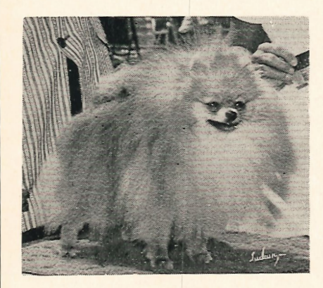
Ch. Queenaire Gamboling Man

Gambler welcomes his daughter to the family's winning ways "Ataway to go, Kid!"