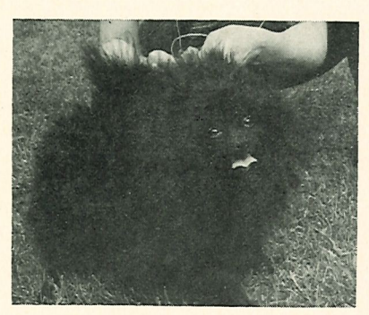
Boulder River Basic Black