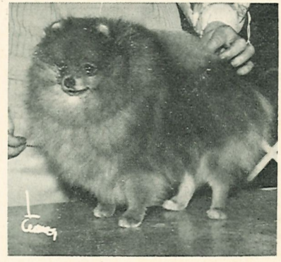
Ch. Mac's Little Bit of Perfection