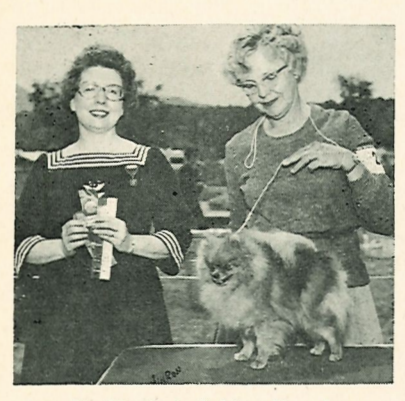
Ch. Manies's Golden Cherub Breeder-owned 5 lb. female.