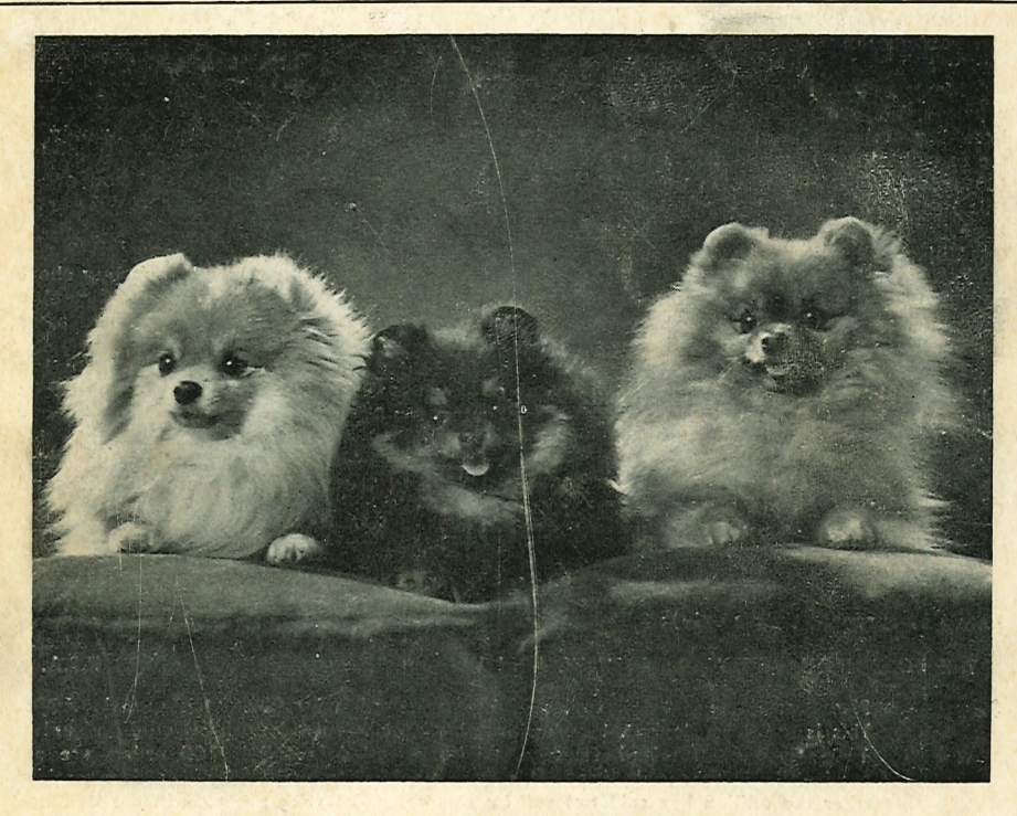
Am. & Can. Ch. Jabil's Simply Smashing Boda's Little Dusky Charmer Ch. Jabil's Chester P. Honeyhugger