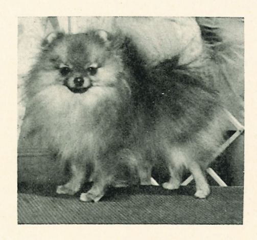
Ch. Pixie's Princess Holly Best of Opposite Sex to Best of Breed at the American Pomeranian Club Summer Specialty