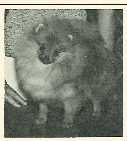
Ch. LLL Lucky Gold Heidi (B)