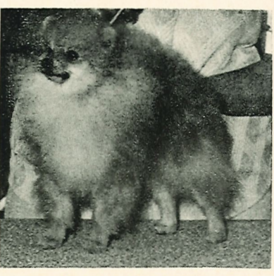
CH. POMIRISH WINNIE'S TUF TIGGER (D)

Gp. 4 International K. C. of Chicago first time out as a Special. Tuffy started his career going 2nd in Sweeps and 3rd in 6-9 mo. class at the 1977 A.P.C. Specialty.