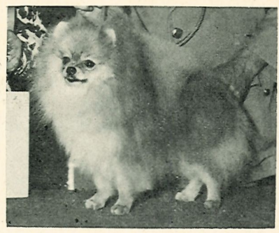
Ch. Tim Sue's Poinciana Star Winners Dog At the American Pomeranian Club Summer Specialty Pedigree Behind The New Champions