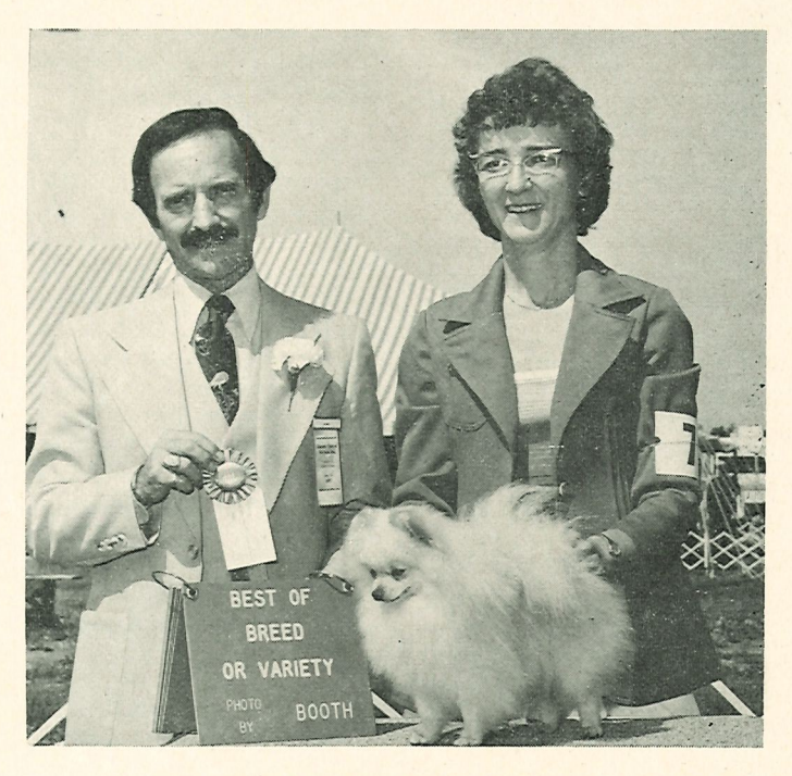
CH. SILVER MEADOWS FROSTEE CUB

Well of course he finished!! Excelling in both soundness and type, we are justifiably proud of Frostee! See his pedigree in