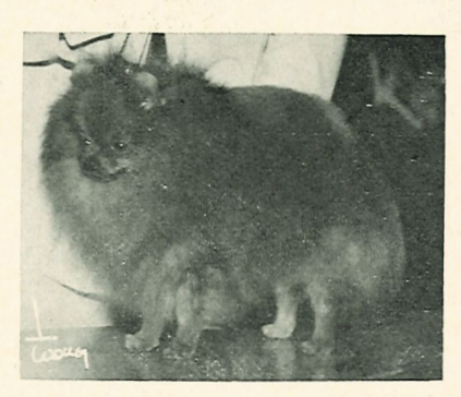
Ch. Tomanoll's Tiny Town Talk 49 BOB — 14 Group Placements