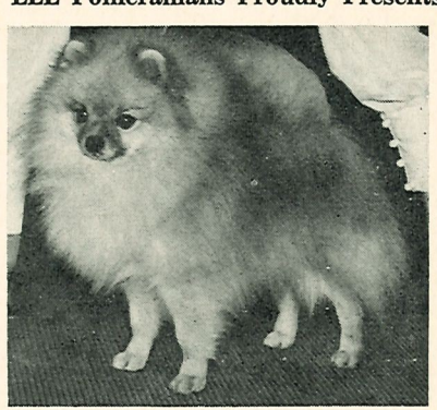
LLL Lucky Gold Trumps (D)

Heidi finished at 10 months with 3 BOB from classes, Group II after defeating 2 specials. Trumps nearly finished, 2 BOB, once over special. Watch for Holly, their full sister, in '78.