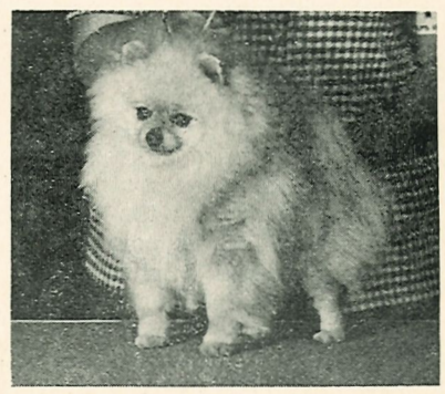
CH. POMIRISH CREAM PUFF (B)

Gp. 4 International K. C. of Chicago first time out as a Special. Tuffy started his career going 2nd in Sweeps and 3rd in 6-9 mo. class at the 1977 A.P.C. Specialty.