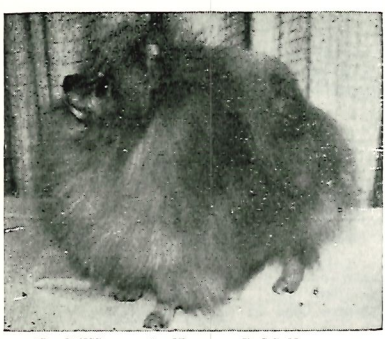
ch. Millamor's Fancy Gold Dancer Sire of a champion with several others on their way.