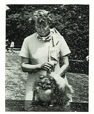
Ch. Copyright of Nanjo 4 lb. Red Fee: $75