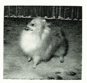
JoArt's Treasure of Nanjo

Club All-Breed Match this past Spring where he defeated the cream of the West Coast youngsters in many breeds. The other is a brilliant Orange, Jo-Art's Treasure of Nanjo, a youngster for which a bright future is predicted by many knowledgeable Pom people.