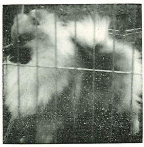
Golden Glow Lonesome George Shaded Bright Orange 4 lbs. - Wh. July 1969 Best in Match (33 entries)

Fa Rob's Red Buttons Ch. Sacramento's Innkeeper Ch. Rider's Gay Robbie Golden Glow Dacotah Kid Sir Reginald Dromore Golden Glow Honey West Gay Honey Bee Golden Glow Lonsome George Pom Ador's Play Boy Pom Ador's Diamond Dan-Dee Lido's Fancy Doll Golden Hill Buttons Rock of Roll Princess Nona Mindy Lou