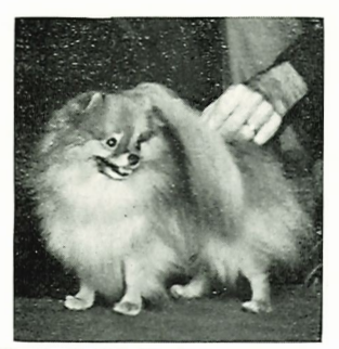
Ch. Jeribeth's Darlin' Boodle-Bug "Duke" son - Proven Stud Already the sire of winners! Fee: $50

102 Elm Street Deer Fark, Texas 77536 Phone: 713/479-1448 (Houston)