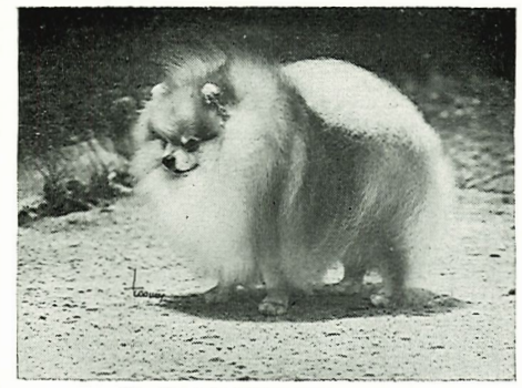
Ch. Corn's Duke Dragonfly Fee: $100 - Reservations necessary Sire and grandsire of BIS winners Consistently producing quality!

Aristic Wee Won's Pepper Ch. Aristic Wee Pepper Pod Aristic Little Miss Cheerful