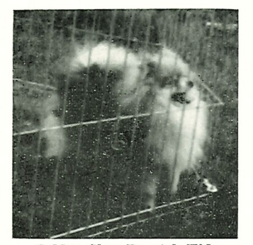
Golden Glow Dacotah Kid Shaded Bright Orange 3½ lbs. - Sireing type Phone: 916/885-9273

Bud Knapp & Chuck Reynolds Rt. 2, Box 2815. Newcastle, Cal. 35658