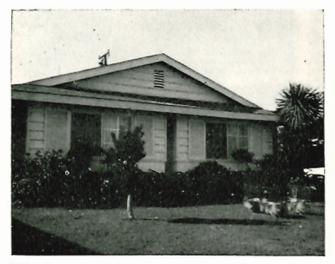
The home of JoArt's Poms and the gang.