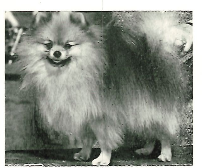
Hillsides Little Pepper Red Orange sable - 4½ lbs. (12 pts. - Both majors) Stud Fee: $50