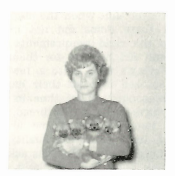
Armful of Joy

their own promising Black Jo-Art's Buckwheat and I wish them all the luck in the world with him.