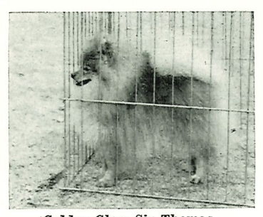
Golden Glow Sir Thomas Shaded Bright Orange 4½ lbs. - Wh. June 1968 For sale to serious breeder Phone 916/663-3612

Am. & Can. Ch. Dromore Bombardier Sir Reginald Dromore Armstrong's Jewel