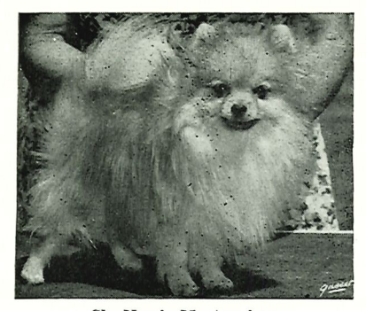
Ch. Nanjo Masterpiece 31 lb. - Orange Fee: $75

Ch. Gold Toy's Gay Flame Ch. Gold Toy's Red Flame Gold Toy's Honey Baby