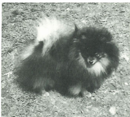
4 lb. Black and Tan \frac{3}{4} Great Elms - \frac{1}{4} Showstopper 4 generations of B/T pic at 10½ mos

Patty Bartels 4976 Monmouth Rd. Mound, MN 55364 (612) 472-5950