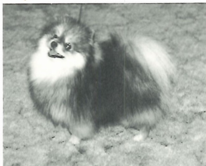
3½# Light Orange

4136 West Lake Rd. Silver Springs, NY 14550 (716) 237-5473