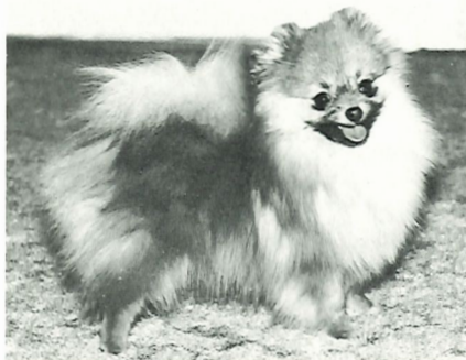
4# Bright Orange

4136 West Lake Rd. Silver Springs, NY 14550 (716) 237-5473