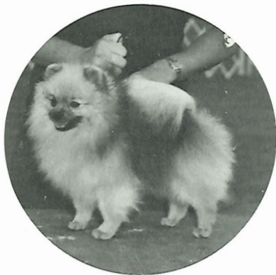
4 lb. - Light Orange-Sable Small ears, short back, sound legs

This is Pomeranian Review's 1983 Register of outstanding stud dogs. On this and the following pages — and in some of the display ads — are stud dogs that, for their individual excellence, unique characteristics or special breeding, stand ready to help every breeder in the country. Inevitably, some owners of fine stud dogs failed to send their entries in, for one reason or another. But with so many represented, from every section of the country, and of many different bloodlines, we feel that our Register this year is very complete. May we request that when breeders send inquiries to stud dog owners, they mention: "I saw your stud card in the Review."