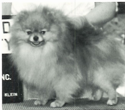
4½# Shaded Orange

4136 West Lake Rd. Silver Springs, NY 14550 (716) 237-5473