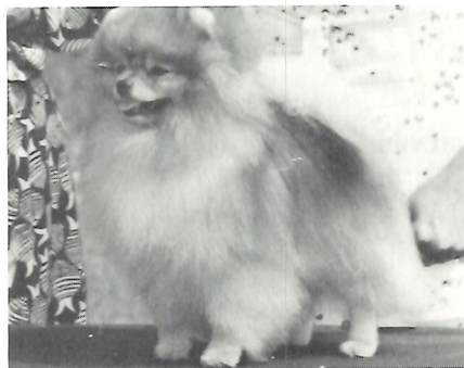
Multiple BIS Winner Ch. Producer — 3 BIS Winners