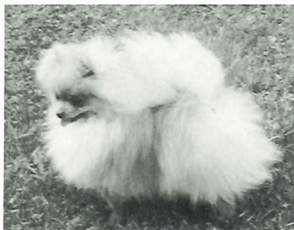
5# Orange Sable

4136 West Lake Rd. Silver Springs, NY 14550 (716) 237-5473