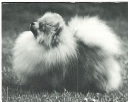
5# Deep Orange