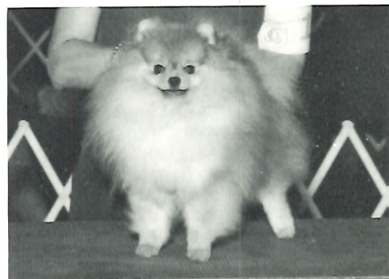
4 lb. Clear Orange Group Winner Sound legs, heavy coat, short back personality and showmanship