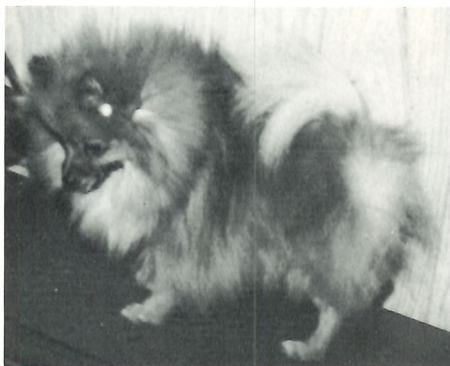
STARLITE GAMBLERS FLIRT