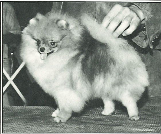
(Ch. Millamor's Rock Music x Starmist daughter)

Manuel Gonzalez (813) 626-1909 (813) 626-8224