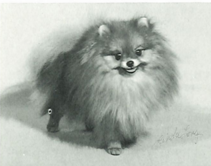
4½ lb., Bright Clear Orange Convenient to Houston Int. Airport