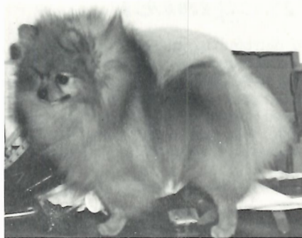
4 lb. Orange Sire of Champions

Ch. May Morning Bravo Bravo May Morning Social Lion May Morning Alice Ch. Theldun's Tim Dandee of Edney Ch. Blair's Solitaire Ch. Dunn's Little Tina Preshus May Morning Sweet Mary Ann CH. EDNEY'S MOE-BEST SPECIAL ORDER Ch. Great Elms Timstopper Again Ch. Great Elms Timstopper's Image Great Elms Linda Postscript Aft'R'noon Delight Ch. Theldun's Tim Dandee of Edney Edney's Miss Pattycake Edney's Taffy