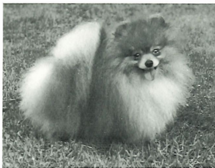
5# Light Orange

Ch. Bonners Darlastyle Xmas Toy Ch. Bonners Kristin Starmist Ch. Bonners Pepper K Goldmist Ch. Bonners Lisastar Legacy Ch. Bonners Stylemodel Wee Wag Bonners Little Miss Wag Bonners Sunfire Mischief CH. SILVER MEADOWS BEAU O' LEGAC Ch. Sunwink of Highland Ch. Silver Meadows Tiger Silver Meadows Lady Taffy Silver Meadows Sybil Ch. Sunwink of Highland Silver Meadows Muffit Silver Meadows Toto