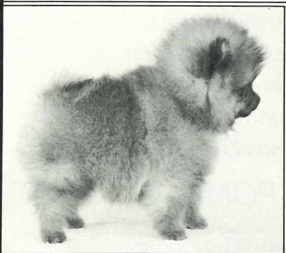
Ch. Kharisma's Punk Rock