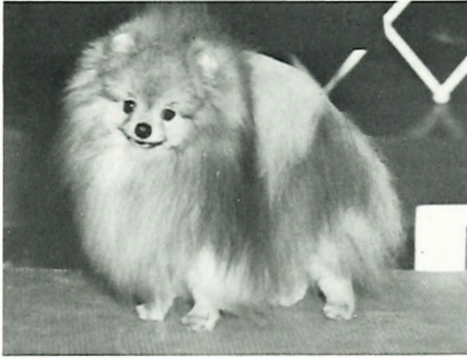
4½ lbs. - Bright Orange Group winner, Sire of Champions Moments from indpls. Airport