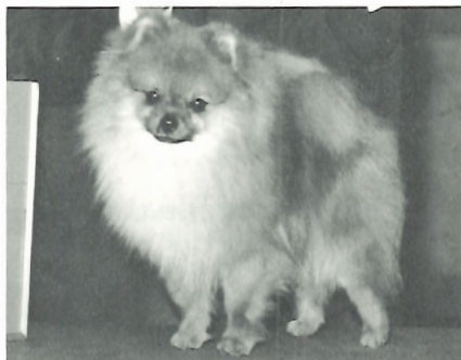
4 lb. Deep Orange Ship to Boston