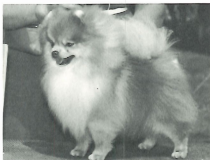
#3 Pom 1982, Multi-Group Winner Ship to Boston.