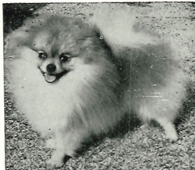
Ch. Golden Glow Sir Reginald Shaded Bright Orange 4 lbs. - Sireing style