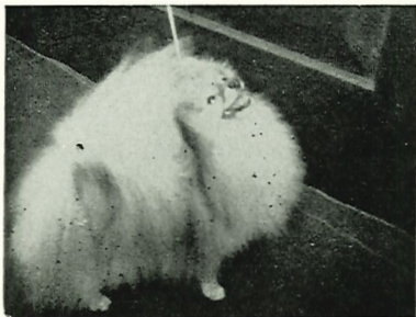
Ch. G. E. Timstopper Again Stud Fee: $50