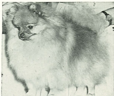
Ch. Blair's Solitaire Red - 4½ lbs. Stud Fee: $75