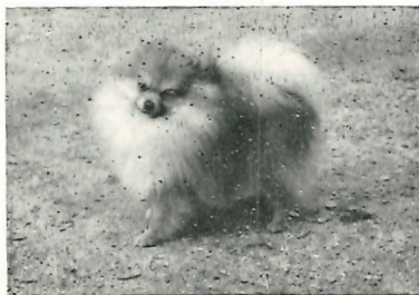
Golden Glow Keeps Sake Shaded Bright Orange 4 lbs. at 9 mo.