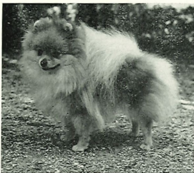
Ch. Windsweet of Highland (Subj. AKC Conf.)

Ch. May Morning Echo of Highland congratulates his first-born offspring, Windsweet of Highland, on the completion of her championship on April 19, 1970. There is an old saying which states that the perfect dog has yet to be born. Yet, we like to think we have perhaps produced this very thing in Windsweet — the impossible — the ideal — the perfect Pomeranian!! Windsweet cannot be faulted! Flawless for conformation, heavy coat of good orange color, small well-placed ears on a beautiful head, lovely expression with the correct small eye, soundest of legs with the highest of tailsets — and to add to this picture of exquisite perfection, she is a well-balanced, shortbacked, animated showman of breedable size combined with the sweetest of forward temperaments. With her heritage of linebred Aristic and Showstopper background, she is our fulfillment of long years of planned breedings for soundness and type. This breeder's dream come true!!!