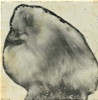
Ch. Toyhomes Little Souvenir

Striving to improve quality with every litter and no breeding from faulted individuals. In 1966, I imported 2 grandsons of Eng. Ch. Little Gent of Hadleigh — with the now extinct Oldderry line on the dam's side — and found it nicked exceptionally well with the Spit-Fyre line, then established on our foundation sire, Ch. De Lill's Honey-Boy. All breedings have been carefully planned by line and inbreeding their offspring.