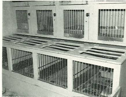
Cages for males. All cages are lined with aluminum.