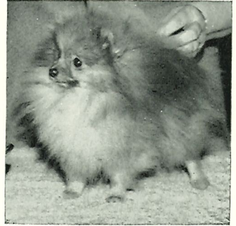
Ch. Nanjo Destiny

Ch. Blair's Solitaire Ch. Trademark of Nanjo Nanjo Tempest Am. & Can. Ch. Stylemaster of Nanjo Ch. Thelcolynn's Tiny Sundance Nanjo Jubilant Tena Marie VI Ch. Thelcolynn's Showstopper Ch. Thelcolynn's Tiny Sundance Ch. Dixie Flame of Thelcolynn Thelcolynn's Tiny Tyeca Thelcolynn's Little Sir Dandy Thelcolynn's Tiny Karla Thelcolynn's Honeybun