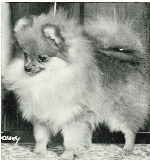
CHAMPION HOLDER'S FANCY FIREFAIRY, (now the dam of two females)