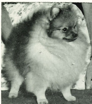
Ch. Blair's Sensation Orange - 3½ lbs. Stud Fee: $75