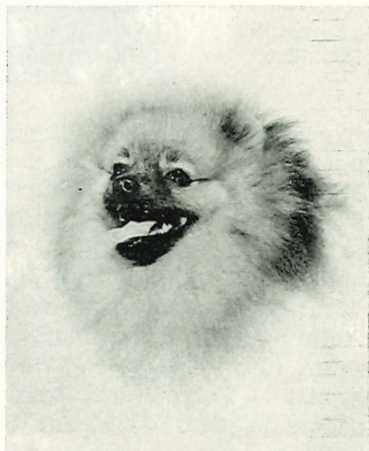
Ch. May Morning Bravo Bravo "Bing" At Stud. Fee: $75