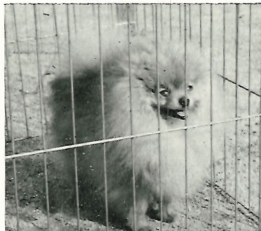
Golden Glow Autumn Sun Bright Red - 3½ lbs. Major Point Winner