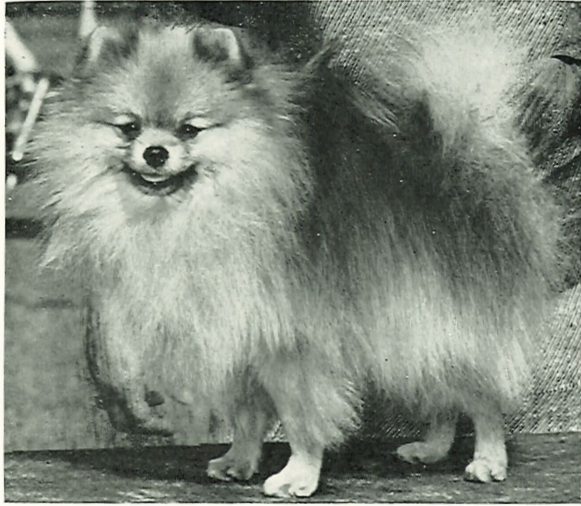
CH. HILLSIDE'S LITTLE PEPPER RED (Subj. AKC Conf.)

PEPPER finished at the Lancaster, Pa. show on May 10, 1970 under the well known all 'rounder, Judge Percy Roberts.