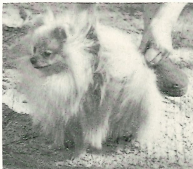
Ch. Stylish Patrick of Spungold Bright orange Sire: Spungold's Stylish Pepper Dam: April of Spungold

Ch. Aristic Wee Pepper Pod Ch. Bonner's Stylepepper Preshus Bonner's Prettytune Precious Spungold's Stylish Pepper (Sire) Ch. Deli Wee Sun Toy Spungold's Sunshine Delsey Amanda Ch. Great Elms Little Timstopper Altwater's Golden Charmer Bepa's Cina April of Spungold (Dam) Reighlynn's Pippenpott Spungold Laurie Reighlynn's Merry Starette