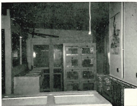
View of bitches' end of kennel. Kennel is air-conditioned.

Much love and affection is showered on the nineteen dogs who reside at Cabert Kennels. And never does the census rise beyond the limits where TENDER, LOVING CARE is not a part of every "little guy's" life. Just as with humans, TLC is essential to produce an emotionally well-balanced dog.