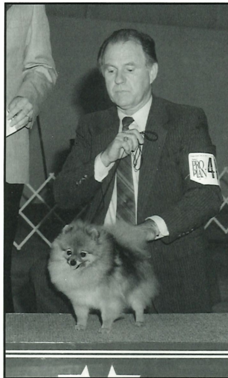
La Cherie's Oreo Double Fudge