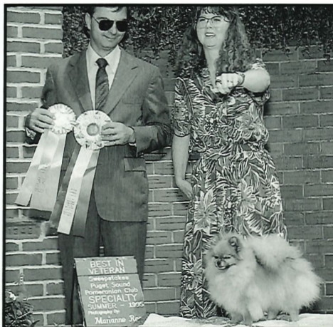
Best Veteran in Sweeps Ch. ValcopyWakhan My Style