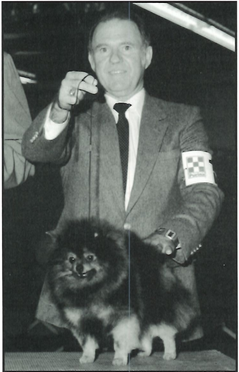
Ch. La Cherie's Hot Fudge Ripple