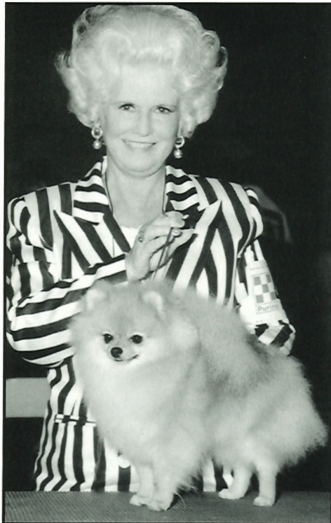
A La Cherie Show Pom

pretty sight. Another pet peeve is looking at little round holes in the rear. Our dogs can look just as short-backed and cobby without removing the hair around the anal area. This is a practice that should be eliminated.