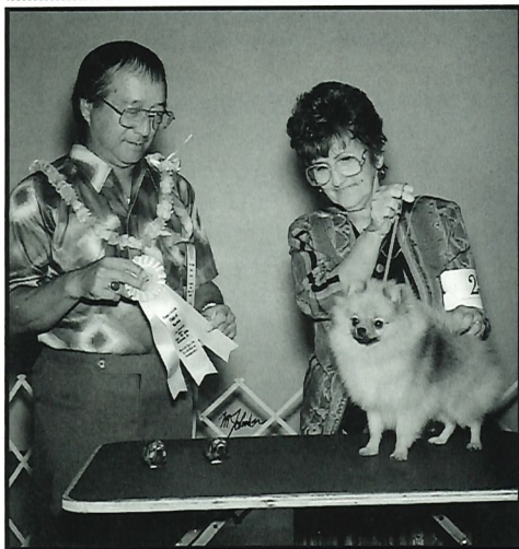
BOS in Sweeps Guys N Gals Crowd Pleaser