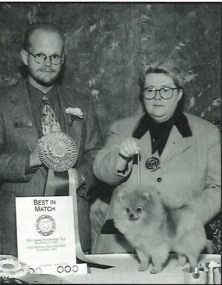
Best in Match Rhea-Na's I Got You Babe

I would like to thank this magazine for the support and coverage of our match. I also thank all those that donated and each worker. I extend my greatest thanks to the exhibitors, without all of you there would not be an Ohio Valley Pomeranian Club Specialty Match. ☺