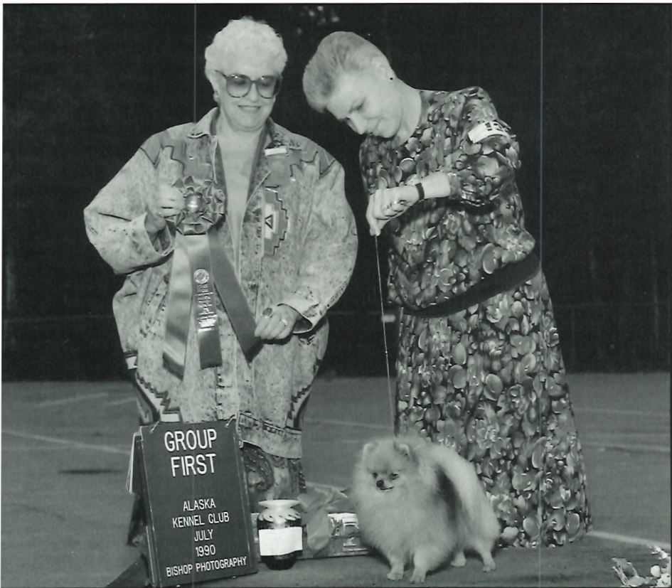
Ch. La Cherie's Little Sir Echo

Sassy produced our heavy sable boy, Judgie, who is still going strong at eight. His first son, La Cherie's Oreo Double Judge, has 17 points, one major, a toy group 4 and the best coat ever. He needs a major to finish but because of several missing teeth in front many judges pass him over. It's very frustrating because he has a scissor's bite and missing front teeth should not be a factor. Early dental loss is a distressing gene in Poms.