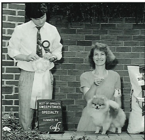
BOS in Sweeps Foxx Glenn's Daystar Magnum Force