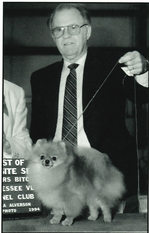
La Cherie's Tribute to Great Elms