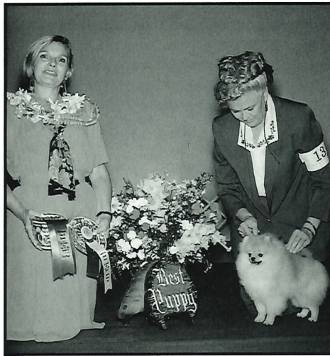
Best Puppy in Show Amour's That's Hot To Trot

MERRY CHRISTMAS AND HAPPY NEW YEAR FROM THE OFFICERS AND BOARD OF THE AMERICAN POMERANIAN CLUB, INC. WE THANK EACH OF YOU IMMENSELY FOR SUPPORTING YOUR MAGAZINE SO WELL!