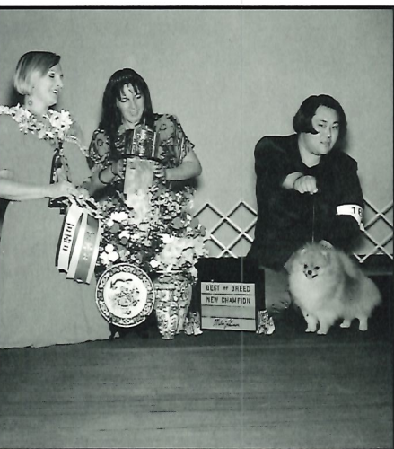
BIS, BW, BB Haiku's Wind Shadow