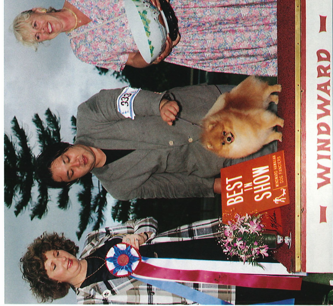
Ch. Haiku's Wind Shadow