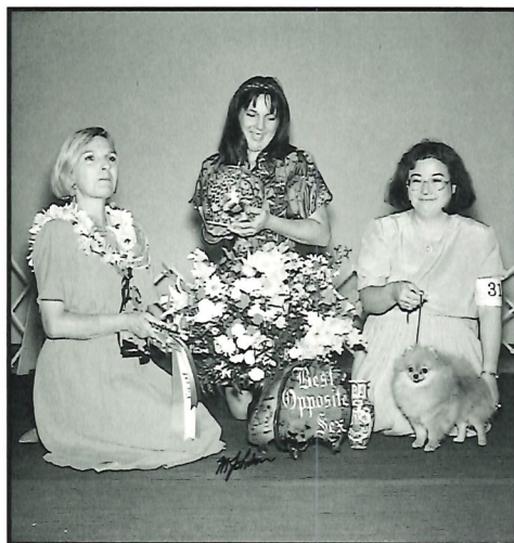
WB, BOS Wee Heart's Vintage Champagne