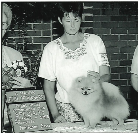
WD, BOW Cheyenne's Grandview Prodigy