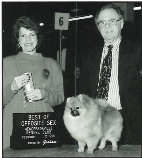
La Cherie's Out Run The Wind

Our kennel is small, about 20 dogs. Every one of them travel with us when we go to shows. They all think they're show dogs and enjoy it as much as we do. It's in the gene bank, you know. ☺