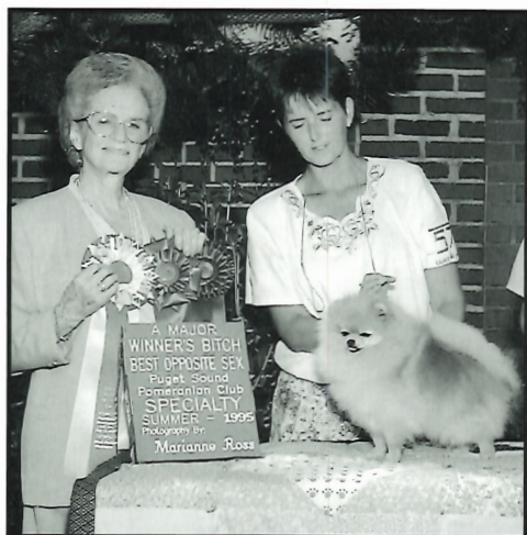
WB and BOS Cheyenne's Champagne Lace