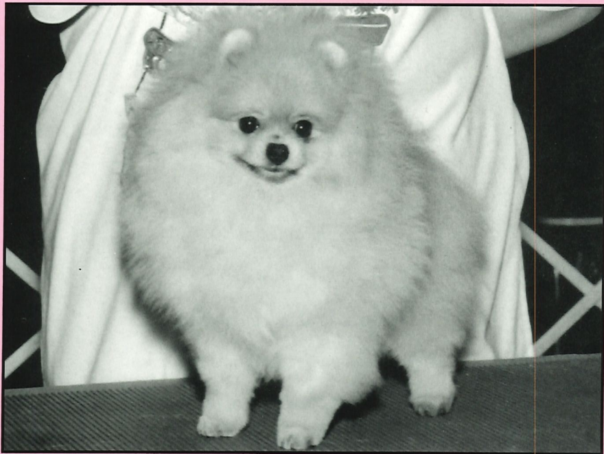
Ch. Shyacres Deja Vu "Voo Doo"

"Voo Doo" a Ch. Shyacres Our Man Friday son is now at public stud at Shyacres.