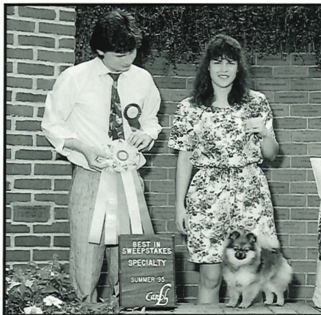
Best in Sweeps Foxx Glenn's Midnite Krystal