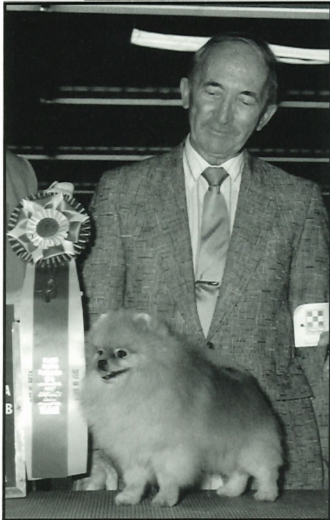
Ch. Jan-Shar's Doc Holiday