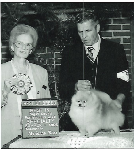
Best of Breed Ch. Rodi's Mr. Rocky Road