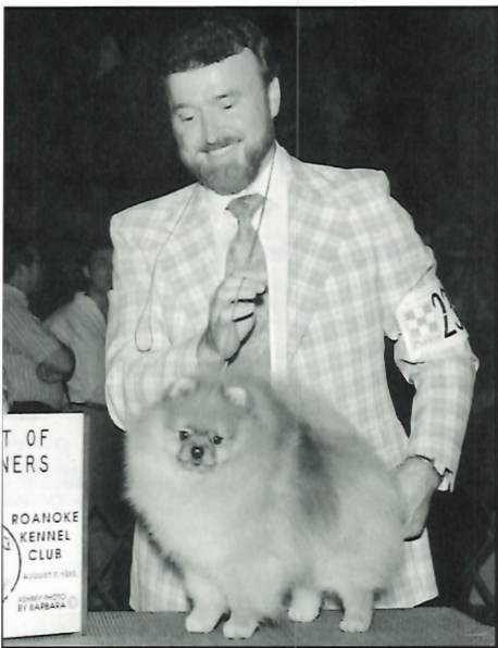
Ch. Great Elms Little Tiger