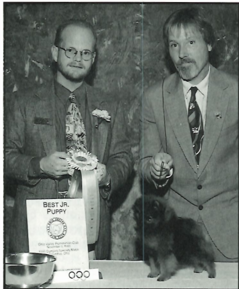
Best Junior Puppy Whispering Lane Easy Street