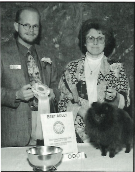
Best Adult Heartland's In The Nicka Time